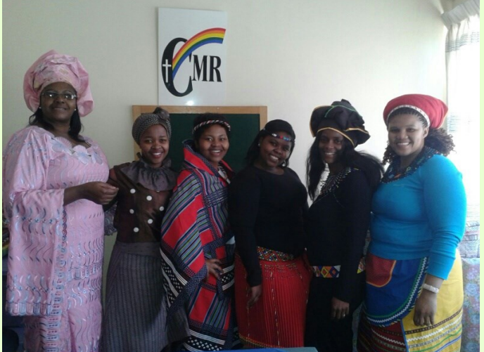
Fourth year Social work students doing their internship at the CMR (Family care NGO), dress up in cultural dress for Casual day supporting people with disabilities.